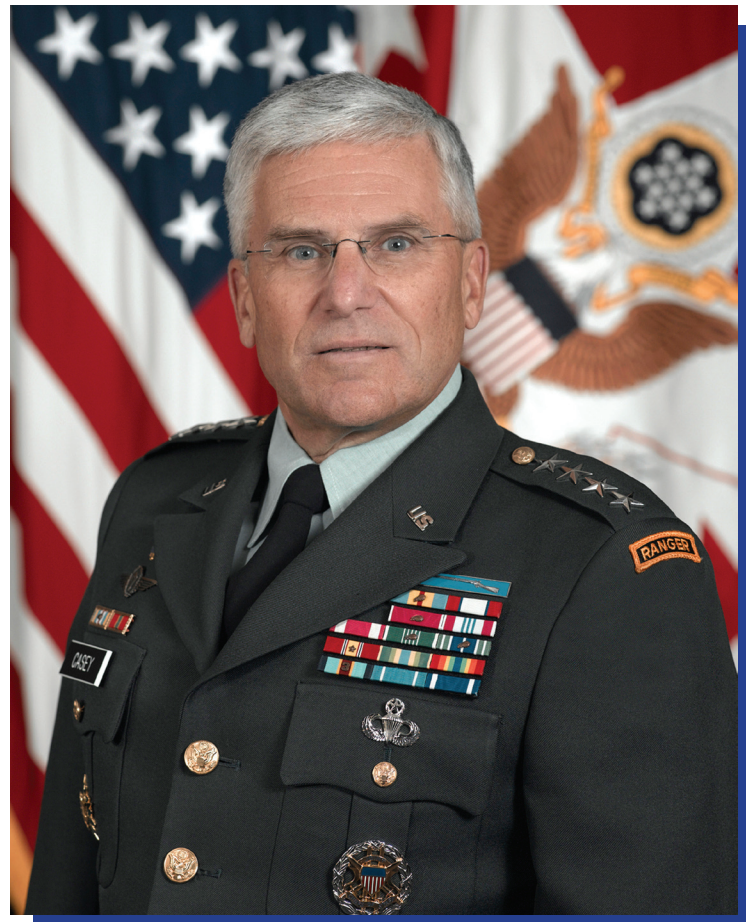
General George W. Casey, Jr.